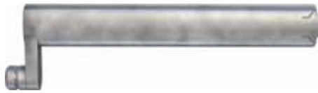
Butterfly Washer Guide Cat. No. 7117-7155