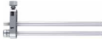
Adjustable Parallel Pin Guide Cat. No. 7117-7154