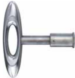
T-Handle w/Large AO Quick Connect Cat. No. 7117-7204