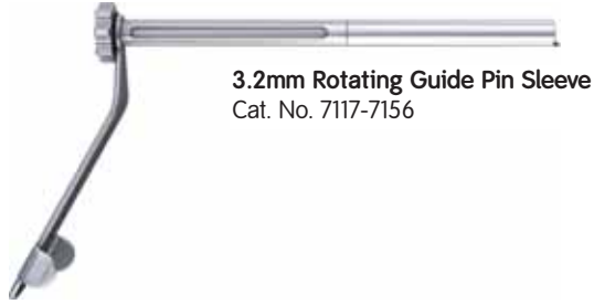
3.2mm Rotating Guide Pin Sleeve Cat. No. 7117-7156