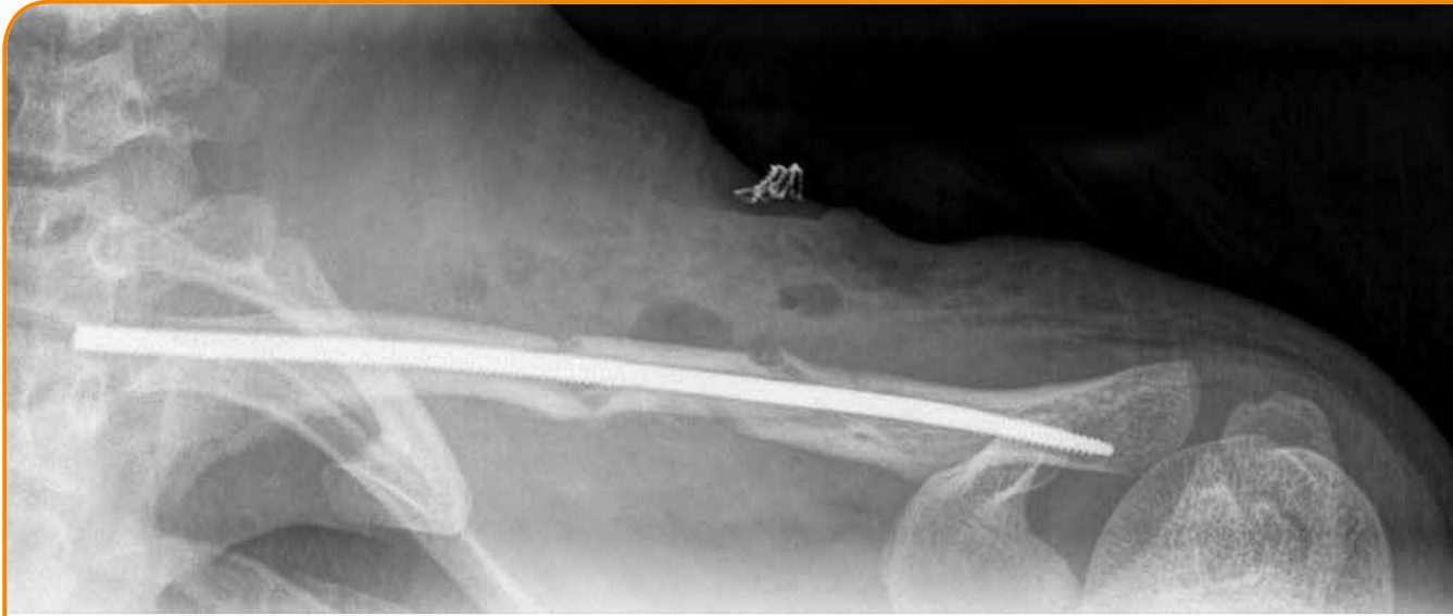
X-ray of the Hofer Clavicle Pin