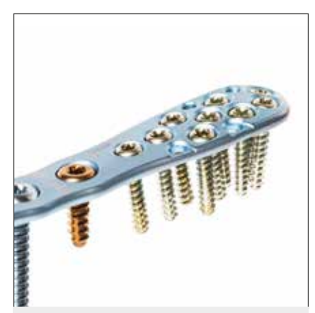
Stable anatomic design for safe preservation of repositioning