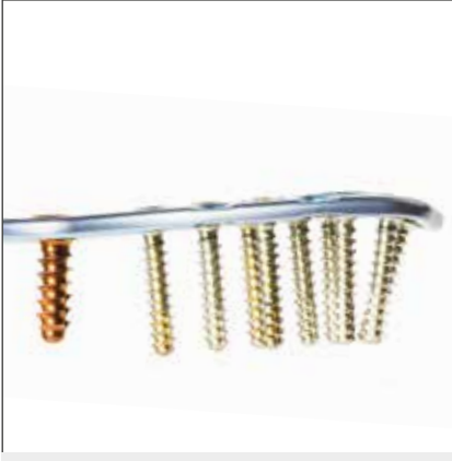
Innovative pre-bending technology of the plate in order to achieve best possible plate - bone alignment