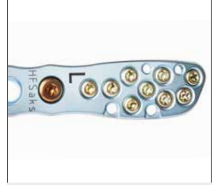
Accurate contour shape of the plate, based on over 100 measured fibulae