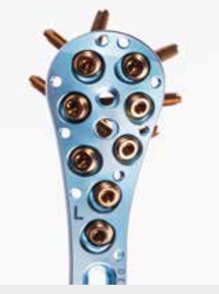
Exact anatomical fit with manadatory definition of the side