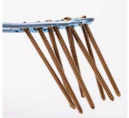
Innovative screw placement for safe support of the joint

Increased stability of the system due to improved placement of the screws